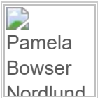
Pamela Bowser Nordlund

----- Jennifer Hill - December 30, 2016 at 08:28 PM